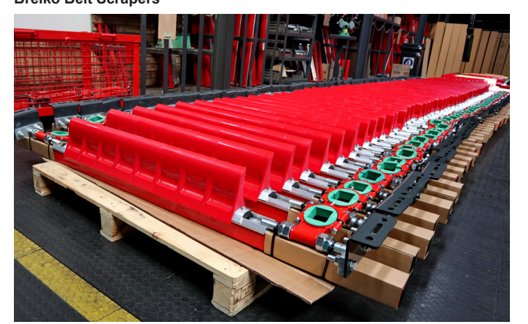
8 | MODERN MINING | December 2022 - COVER STORY