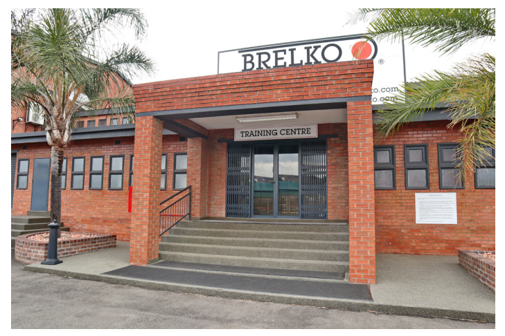
Brelko Training Centre.

the Saudi state-owned mining company headquartered in Riyadh, to the tune of over $500 thousand this year alone," he adds.